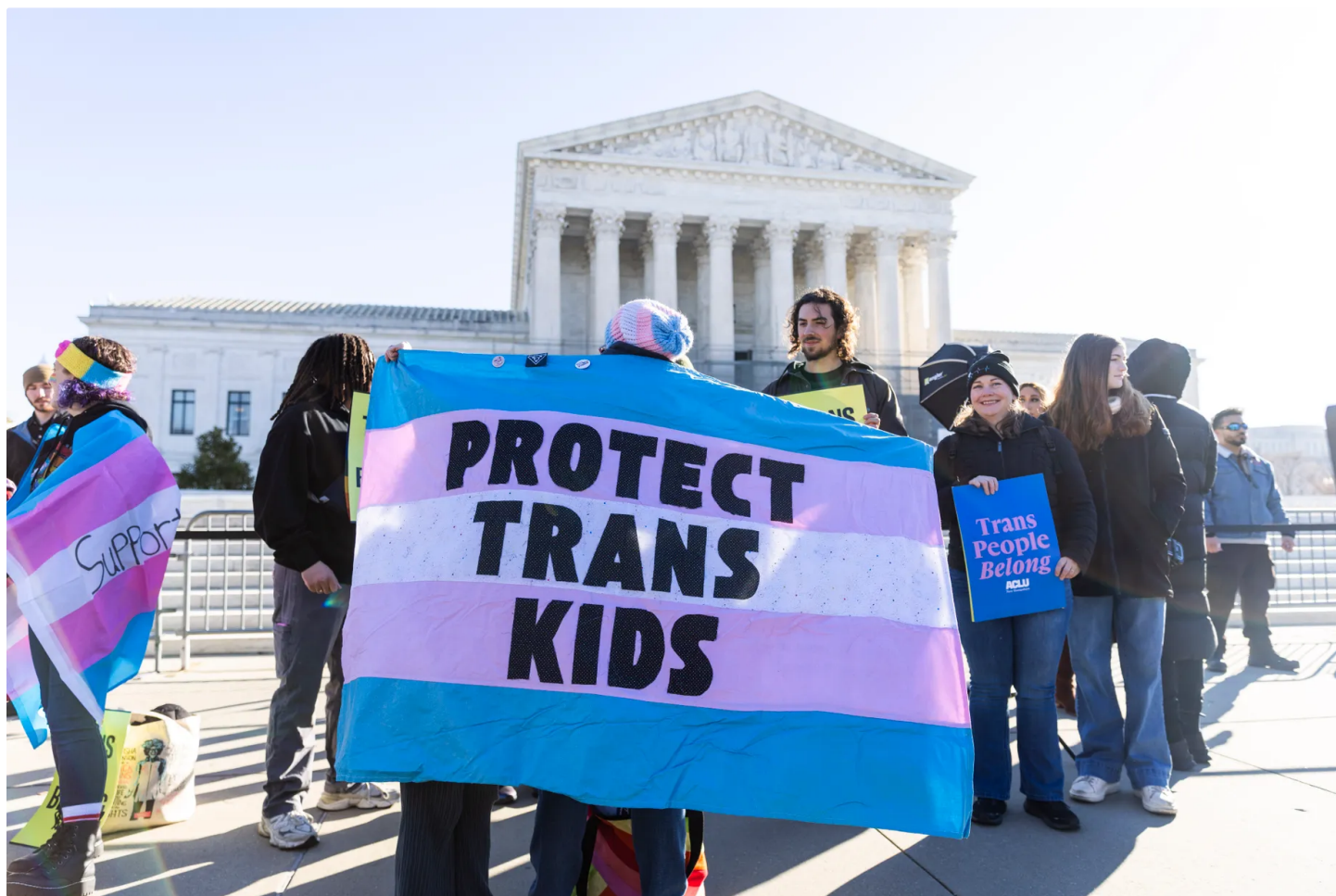
Demonstration for transgender rights in front of the Supreme Court in January 2026.

It's just sitting there in the corner. A small, red backpack leaning against the wall, seemingly just another item temporarily forgotten amid the detritus randomly strewn about this shared student apartment in Seattle's University District. But while